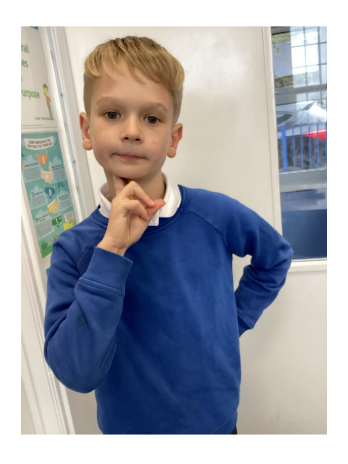
Meet the Team!